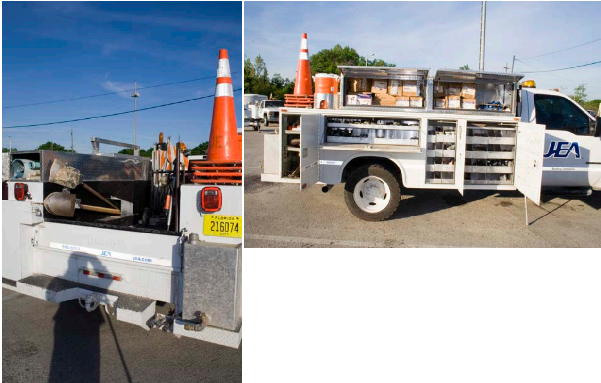
Figure 4: Water Infrastructure Maintenance Trucks After Lean Improvements

The team also created a plan to ensure that the new system would be sustained, which contained the following steps: