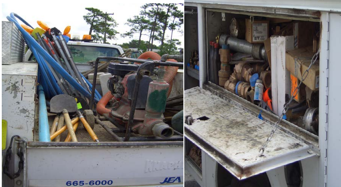
Figure 3: Water Infrastructure Maintenance Trucks Before Lean Improvements

Within JEA's DMAGIC framework for Lean Six Sigma projects, the project team studied the process, using tools such as Pareto charts, X-Y matrix, direct process observations, root-cause analysis, and "five whys" questioning, and concluded that the top two factors leading to increased time were material being difficult to locate on the truck and material being difficult to get off of the truck. To address these concerns, the team used the Lean method of 5S to organize and standardize the materials on the trucks. 5S is a five-step process (Sort, Set in order, Shine, Standardize, and Sustain) designed to create and maintain a clean, neat, and orderly workplace. Through 5S, the team developed a standard system for configuring the bins and materials on trucks (allowing some regional variation in the quantities of materials), including labels and magnetic signs for bins and compartment doors, and notebooks with pictures and descriptions of each item. This standard system was implemented on all trucks used for water infrastructure maintenance.